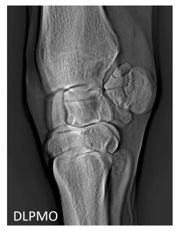
Fig 1. Tomosynthesis slices of accessory carpal bone fracture.