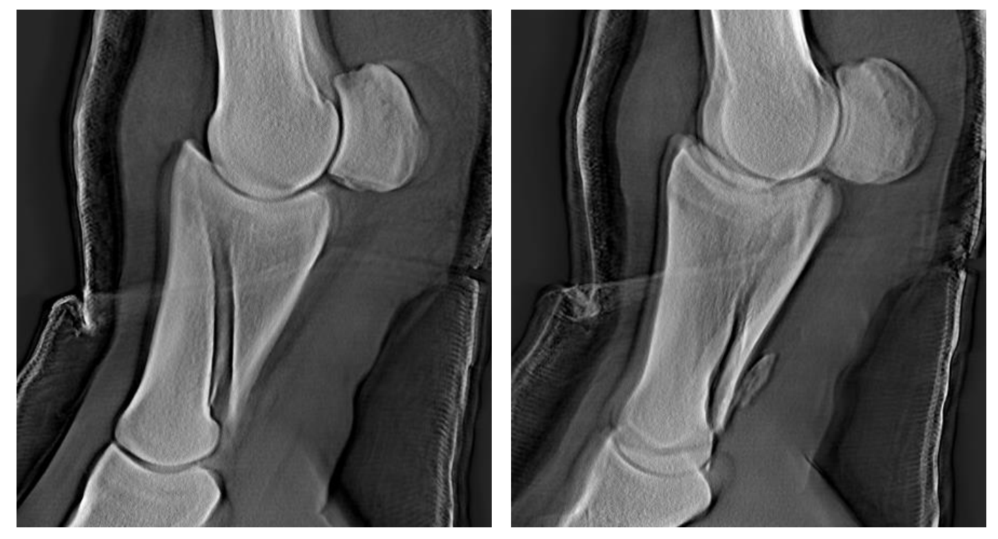
Fig 2. Tomosynthesis lateromedial view slices of P1 fracture.

As the prognosis was bad to get the horse back into sport the owner decided for euthanasia.