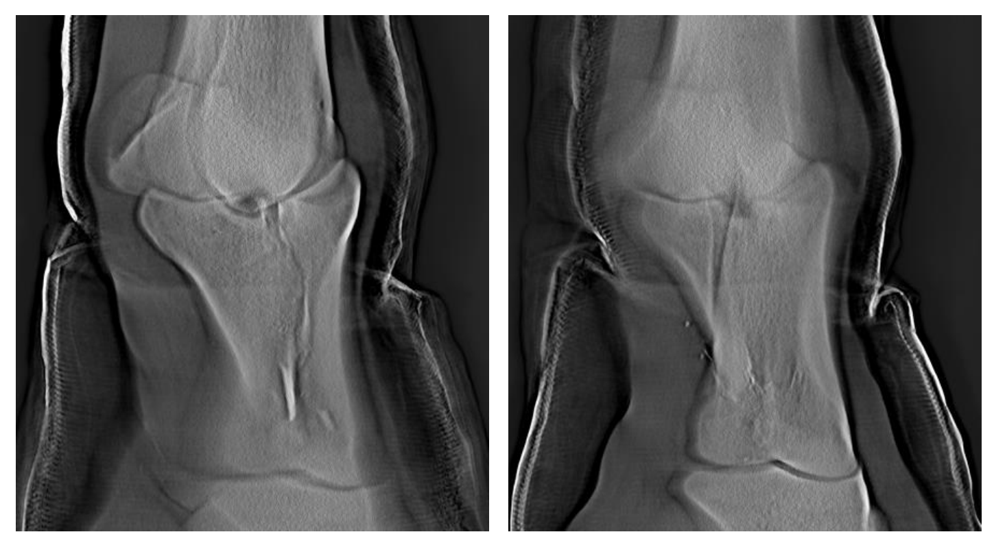
Fig 4. Tomosynthesis DMPLO view slices of P1 fracture.