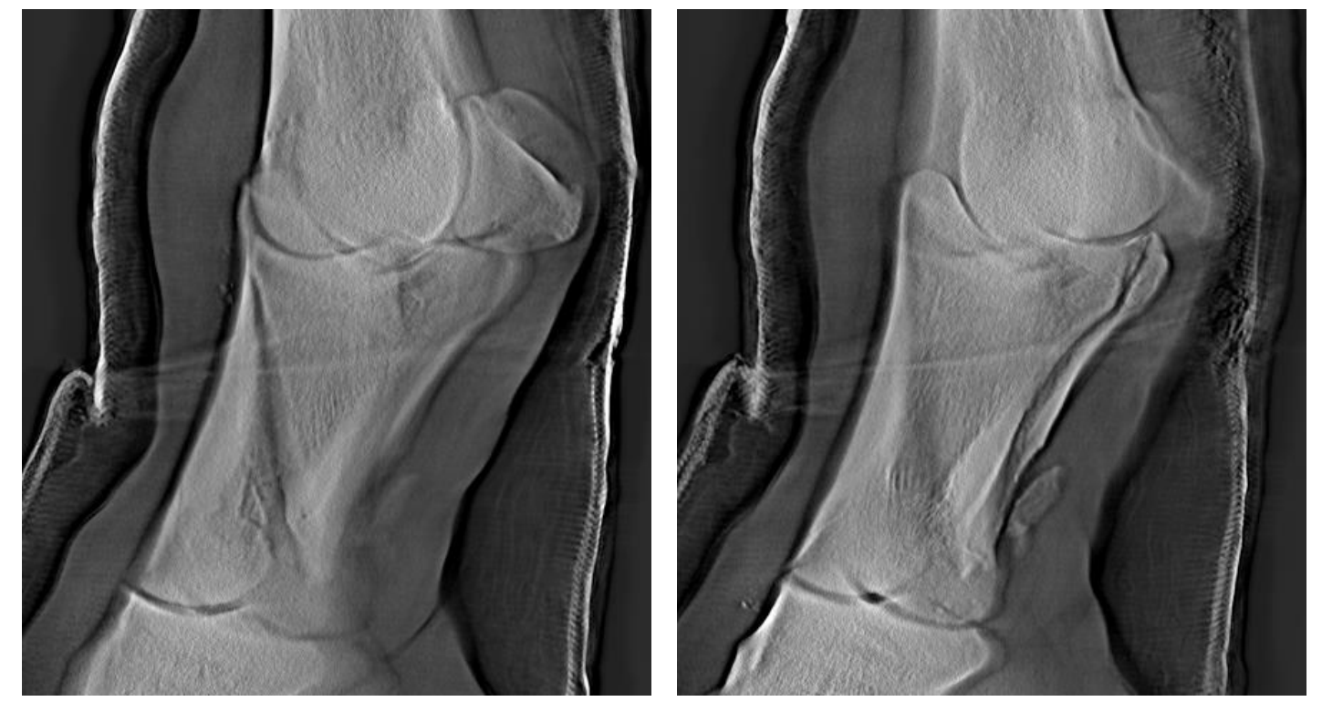
Fig 3. Tomosynthesis DLPMO view slices of P1 fracture.