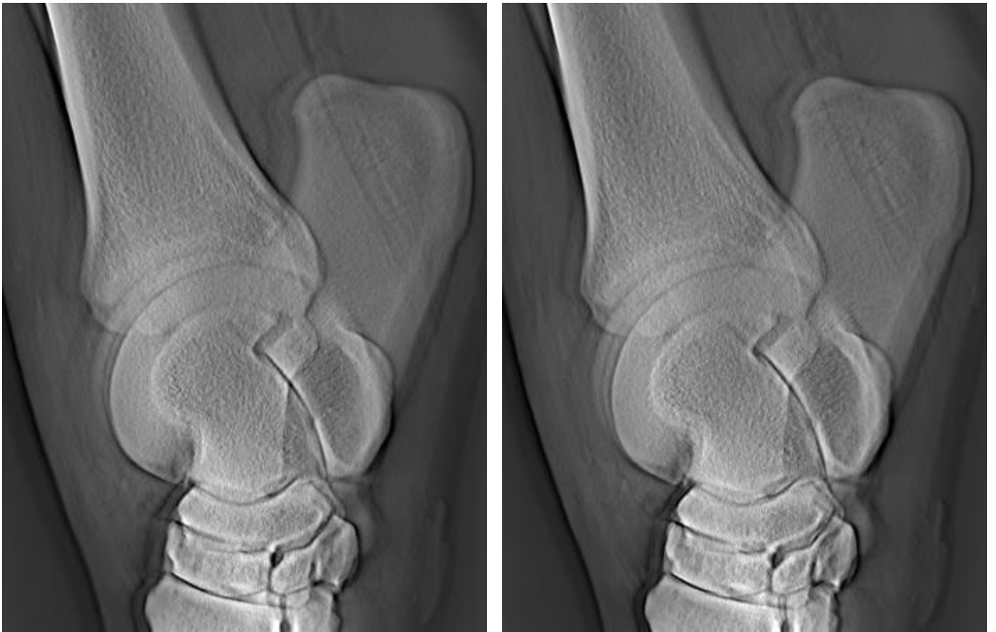
Fig 2. Tomosynthesis lateromedial view slices (with 3mm distance between them).

Diagnosis: Incomplete articular fracture of the third tarsal bone of the left hind limb.