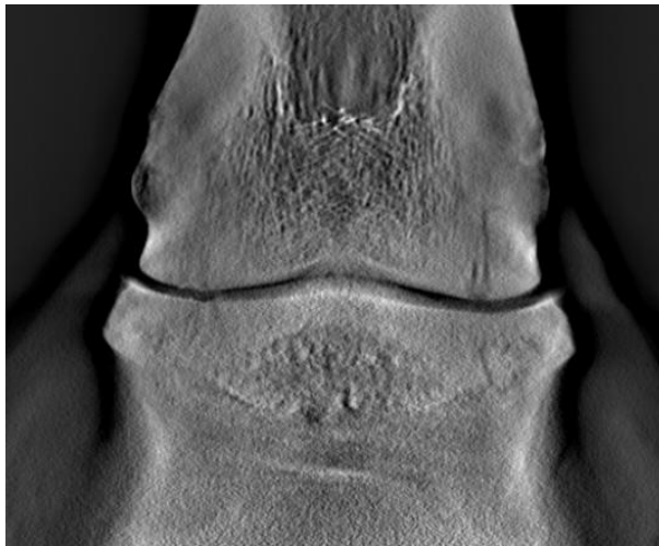
Fig 1. DTS slice #140

Dorsopalmar (DP) view of the pastern, showing two sagittal lucent lines extending from articular surface of the medial condyle 2nd phalanx at the palmar cortices' slices in focus (Fig 1). These changes not visualized closer to the dorsal cortices of 2nd phalanx (Fig 2).