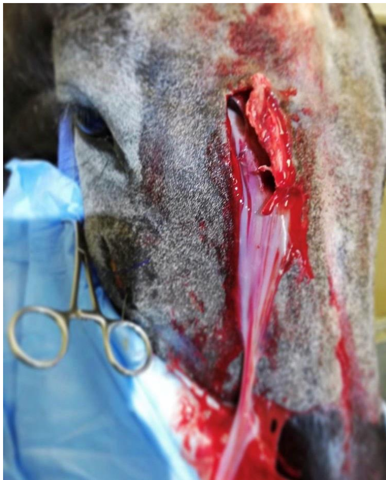
Fig 3. Surgical trepanation of the right caudal sinus maxillaris

Treatment: Surgical trepanation of the right caudal sinus maxillaris opened a purulent abscess.